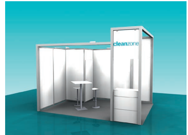
Illustration exemplary for 12 sqm. You will receive an individual stand draft.

for stand space, equipment/stand construction plus media package (750 €), environmental contribution (3.90 €/sqm), AUMA charge (0.60 €/sqm) and VAT.